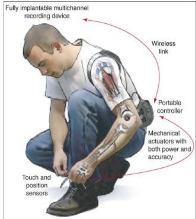
Figure 1: The device fully incorporated into the patient's internal body schema

to name a few (Lebedev & Nicolelis, 2006). It was also hoped that BMIs could provide assistance to amputees. One of the key characteristics desired in BMIs is the addition of the device into the individual's internal representation of their body, allowing the mind to feel as though the interface is a natural part of the body that can be used with little conscious effort.