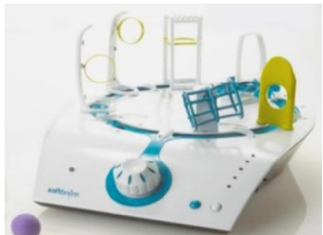
Figure 3 "Mindflex," a commercially available brain machine interfacing game

Brain machine interfaces have shown great potential in the lab, but how does addition of the foreign body to an individual's body schema work in less structured situations such as playing a game that utilizes a brain machine interface?